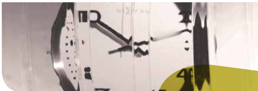
Warwick™ Privacy Level 1

To discover more about the use of Warwick™ please visit our website