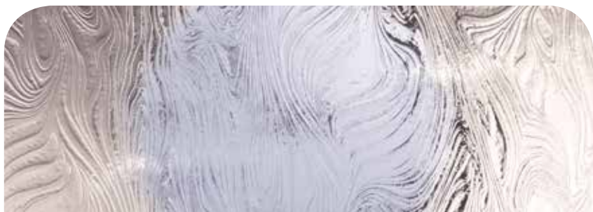
Taffeta™ Privacy Level 3