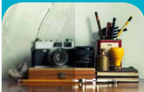
Privacy Level 1