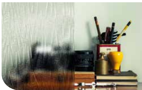
Privacy Level 4