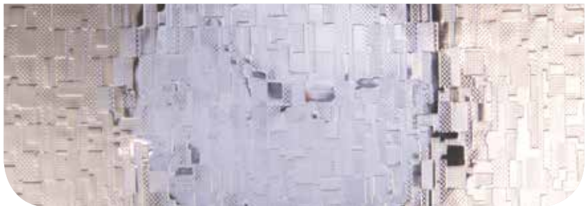
Digital™ Privacy Level 3