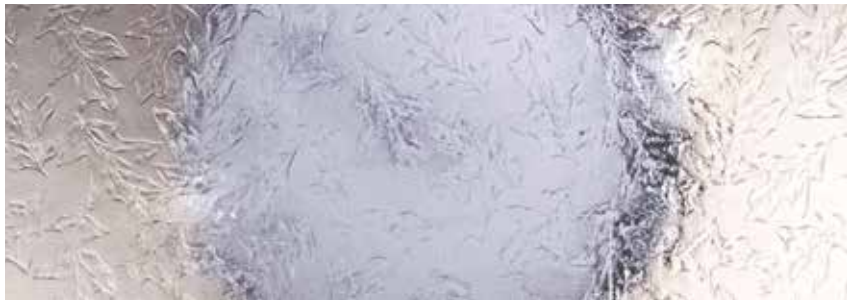
Oak™ Privacy Level 4