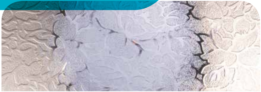
Florielle™ Privacy Level 4