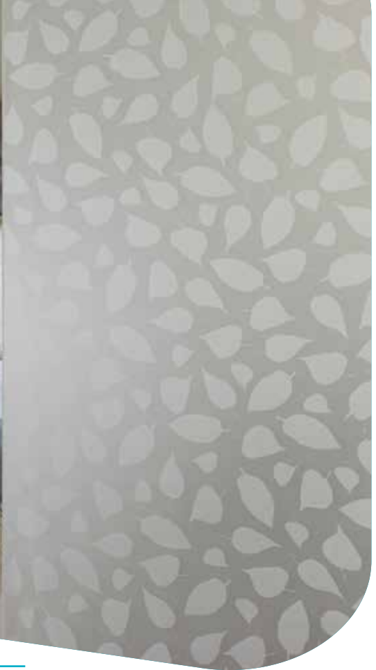
Bay™ Opal Privacy Level 5