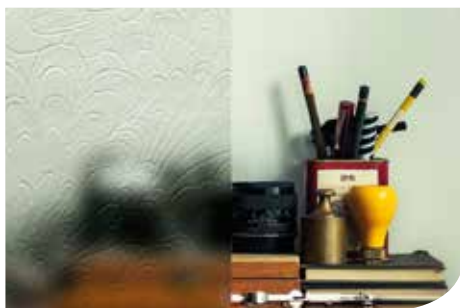
Privacy Level 5