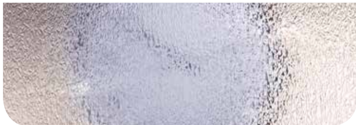
Contora™ Privacy Level 4