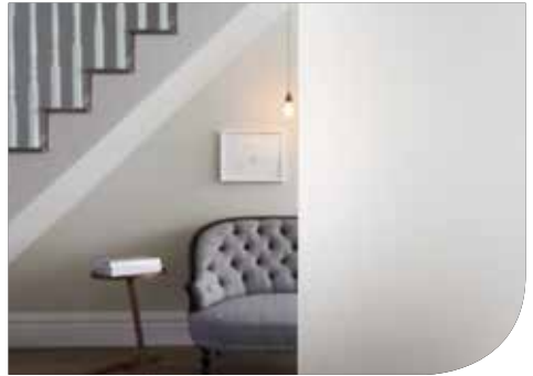
Pilkington Optifloat™ Opal Privacy Level 5