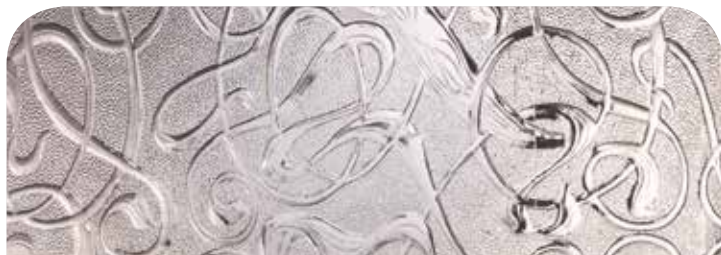
Everglade™ Privacy Level 5

Choose from a wide range of great Pilkington designs